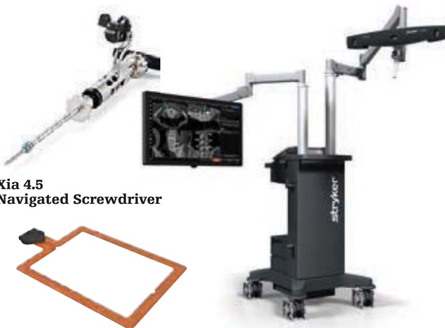
Xia 4.5 Navigated Screwdriver

Stryker offers powered screw insertion options in both corded and cordless styles. These instruments are designed to work with the complete line of open (Xia 4.5), less invasive (Xia CT) and percutaneous (ES2) fixation options. Stryker's powered screw insertion system, in collaboration with a comprehensive range of implants, is designed to reduce the repetitive stress and fatigue surgeons encounter when inserting screws manually.