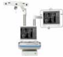
Stryker SpineMap 3D Navigation Software

A surgeon must always rely on his or her own professional clinical judgment when deciding whether to use a particular product when treating a particular patient. Stryker does not dispense medical advice and recommends that surgeons be trained in the use of any particular product before using it in surgery.