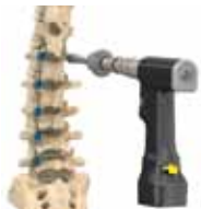
CD3 Powered Screw Insertion